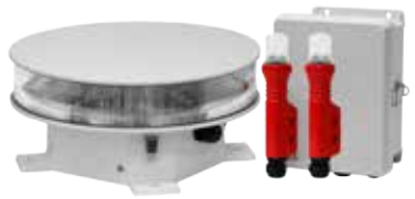
A-1 lighting system for A-type towers over 150' and up to 350' AGL