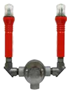
A-0 lighting system for A-type towers less than 150' AGL

The FTS 2201 is an AC-powered red lighting system for structures up to 350' AGL (FAA A-type towers). It can include a red LED flashing beacon and/or LED steady burn markers for night.